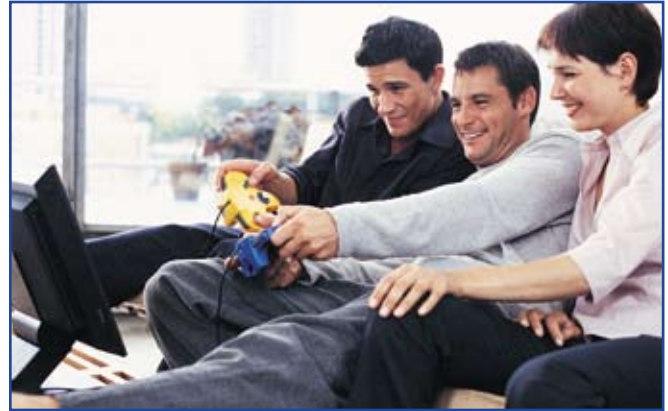
Hotel management can up-sell bandwidth to guests for bandwidth-intensive applications, such as online video gaming.

EthoStream's Bandwidth Management System is designed to provide complete control of bandwidth allocation across a hotel's network. Its advanced functions enable hotel management to control and manage bandwidth use to maximize efficiency. The system provides full visibility of bandwidth consumption, as well as the ability to dynamically or manually limit bandwidth access, to ensure that all guests enjoy the same smooth, high performance. EthoStream's Bandwidth Management System is enhanced with an intuitive remote management console, backed by a full-time support center, so that hotel management can offer their guests the most sophisticated Internet service available. The scope of EthoStream's Bandwidth Management System reinforces EthoStream's commitment to servicing the hospitality industry with leading-edge broadband solutions.