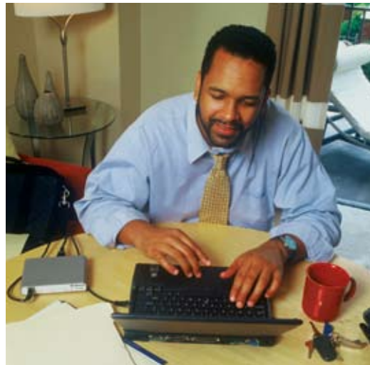
Telkonet's iBridge plug-and-play concept makes it easy to use, while delivering reliable and consistent performance.

Users will find the Telkonet iBridge easy to use. There are no drivers or additional software to install, and typically, computer laptop settings do not need to be changed.